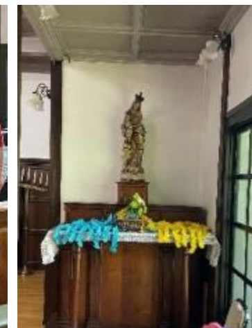
Gathering for Children